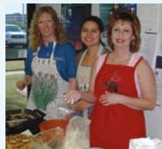
DDOK's Professional Relations team's fried green tomatoes took home top honors in the "Tailgate Thursday" cook-off to support breast cancer research.

Fall means football in Oklahoma. DDOK recently tapped into the fall frenzy to benefit breast cancer research and the Susan B. Komen Foundation. DDOK employees were invited to donate $15 each for the privilege of wearing jeans to work for one week. In addition, team members were challenged to make their favorite dish and compete in a "Tailgate Thursday!" cook-off.