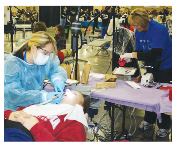
Volunteer dental hygienists and a patient at the OkMOM held in Oklahoma City last February.

Money contributed by Delta Dental through the A-MOM Facebook campaign will be used to purchased patient chairs and portable delivery units. But members of the Oklahoma Dental Hygienists Association made it known to