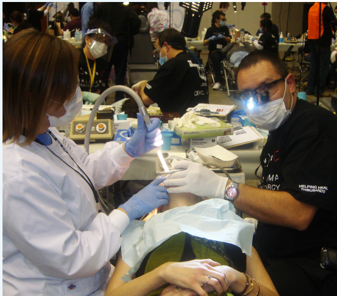
Volunteer dental professionals served more than 1,800 patients at the 2010 OkMOM in Tulsa.

Our new logo, a tooth within a heart, accompanies the new name. The logo represents how oral health is at the heart of everything we do.