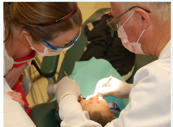
Below: Volunteer dental professionals provide screenings and care at the Norman Regional Foundation's "Give Kids a Smile" day

The Rose State College Dental Hygiene Children's Clinic offers free services for low-income families while providing supervised hands-on training for the program's dental hygiene students.