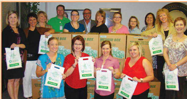
Above: Just a few of the dozens of DDOK employees who assembled 1,500 brush kits for RAM Oklahoma patients.

Learn more about the event at our website, www.DDOKFoundation.org .