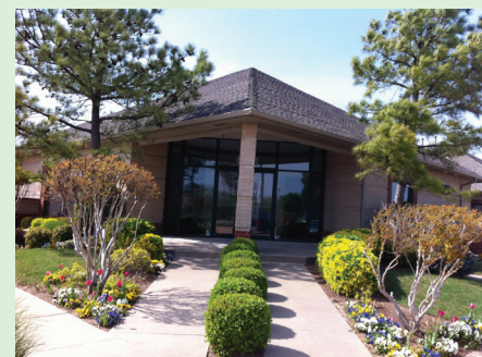
Temporary facility for NSO Dental Clinic

For more information about NSO's relocation or the ongoing capital campaign, call 405-236-0452.