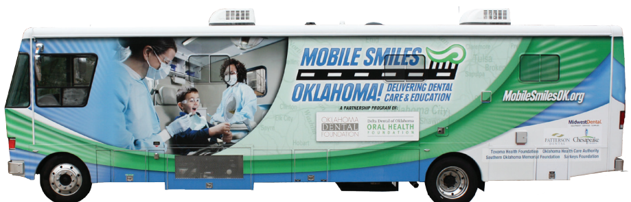
The new Mobile Unit wrap shows off the interior of the state-of-the-art dental clinic on wheels.